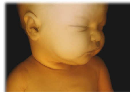
Over 2,000 children are killed by abortion every day in the United States

"Abortion is an intrinsic evil, meaning that it is never permitted or morally justified, regardless of individual circumstances or intentions." USCCB, September 2020