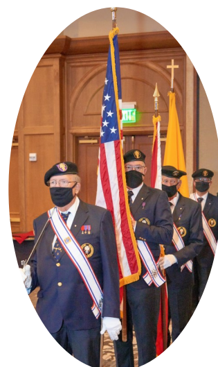
Knights of Columbus Assembly 2368 Color Corps posted the colors at the Gala

Candace's closing message was one of hope. "People are waking up...something is changing. We're fighting a spiritual battle. It's a battle of good versus evil, of Satan versus God. I'm just saying, if you have to be on one side, God is the right side to be on."